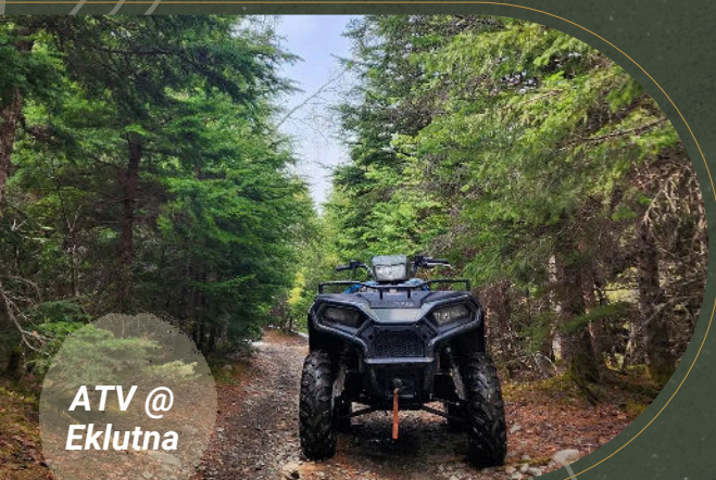
ATV @ Eklutna

OCT HALLOWEEN BIKE RIDE @ EAGLELEN 24TH AGES 9+ | $30 1000-1400