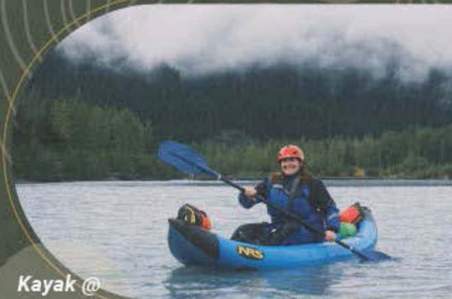
Kayak @ Portage River