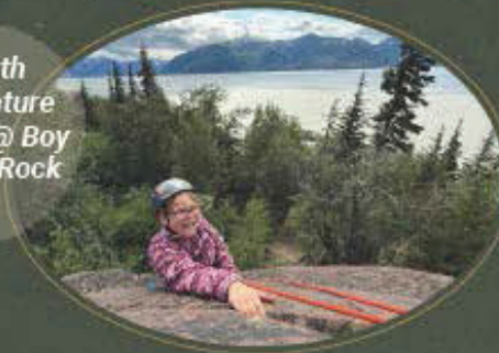
Youth Adventure Camp @ Boy Scout Rock

SESSION I SESSION II SESSION III SESSION IV JUNE 22-26TH AGES 8-10 JULY 6-10TH AGES 8-10 JULY 20-24TH AGES 11-13 AUG 3-7TH AGES 8-10