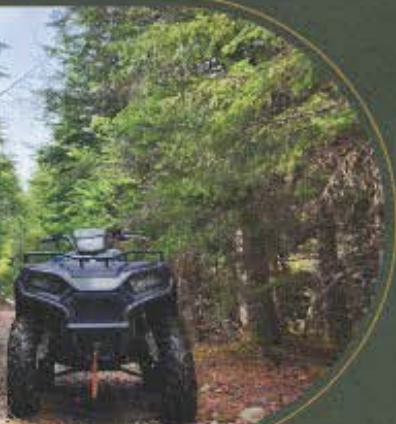
ATV @ Eklutna

JUNE JULY KAYAK @ PORTAGE RIVER 21ST 19TH AGES 14+ | $85 0730-1700